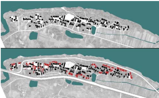
Fig. 3 Spatial transformation in Leicun area