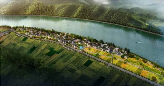
Fig. 4 General plan of Leicun project

stormwater flows over a wide area. Besides, we focus on the restoration of ecological and productive landscapes, such as farmland, vegetable land, fruit trees and vegetation around, to rebuild the localized rural context.