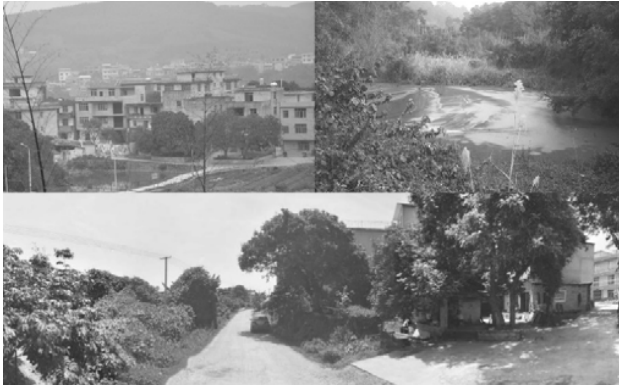
Fig. 2 Challenges of village recession in Huanjiang

also integrated to steer new type of rural development in the interests of the wider region. [4]