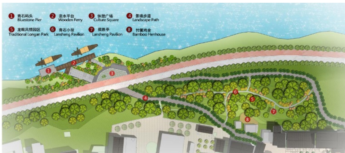
Fig. 5 General plan of waterfront longan park and ferry