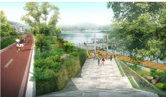
Fig. 6 Rendering of the cycling path and old ferry

In summary, based on the existing features, it is important to preserve waterfront landscape and the characteristics of native production and rural industry through rebuilding the diversity and attractiveness. Placed in the upgraded rural environment, new format of local tourism industry will bring about the optimization of the modern rural economy structure and the sustainable development of community environment.