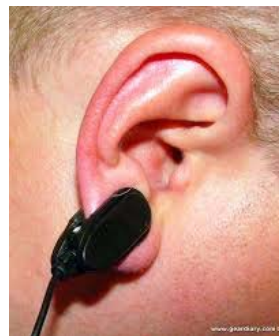
Fig. 2 Ear sensory device