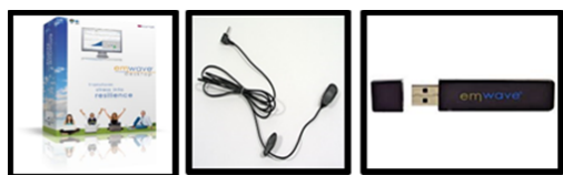
Fig. 1 EmWave kit

Fig. 1 shows the instrument that has been used in this research, the emWave kit. The instrument's function is to act as a controlling device which may help reduce emotional pressure, improve one's internal balance, and increase the energy level and performance of the participant. The instrument is uncomplicated and is suitable to be used anywhere; it is made up of mainly of a USB drive which will be connected to the computer, and a pulse identifier, which can be temporarily clipped to the ear.