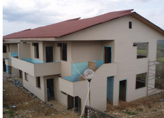
Fig. 8 Photo of the unit during the construction [33]

Beriköy is a project that which has been started by eleven architecture and engineering students in September, 1999 and, as Jan Wampler says, reflects a progressive approach. The group has worked for three months in order to determine the concept of the settlement and the first design ideas. In January, 2000 the projects have been brought to Turkey and opinions of some academician from Istanbul Technical University and various professionals have been 50 dwellings were planned; each dwelling living 60-90 square meters in two stories. Dwellings were coming together as a group of two or four units. In dwellings, balcony, sun roof and other facade options have been left to the users' preferences [34].