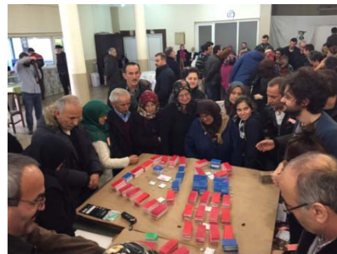
Fig. 10 Users are playing the game named "simulasyon"[36]

In order to achieve the user participation, a game called "Simülasyon" (Simulation) has been designed. The aim of the game is to take the users' opinion about the environment and their dwelling into consideration in order to create the site plan and built concept. (Figs. 10, 11)