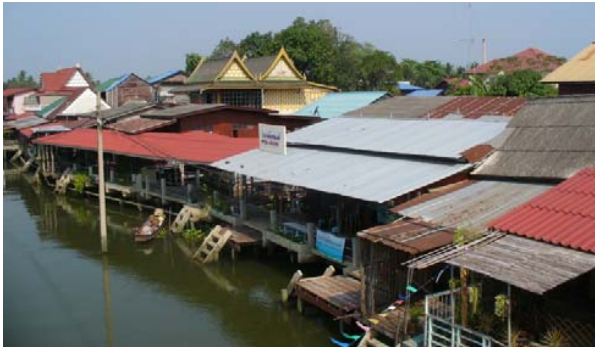
Fig. 3 Examples that were rare to find and showed riverside architectural development