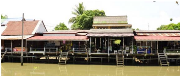
Fig. 4 Community atmosphere, waterfront

The sequent research should study the riverside architectures in each region of Thailand in order to find the architectural identities of each region.