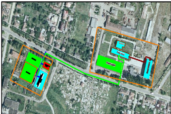
Fig. 1a. The evacuation concept (the evacuee's reception center, the mobile medical point and the accommodation center)

schematically presented in Figure 1a (the evacuee's reception center, the mobile medical point and the accommodation center) and Figure 1b.