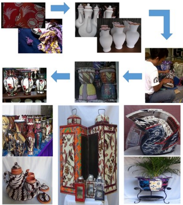
Fig. 2 Product of Mosaic Batik

Mosaic Batik is one of the innovations of clean production and creativity from the Institute of Course and Training (LKP) Bogor Batik which utilizes batik scrap waste, so there is no waste remaining (zero waste). Pieces of the batik patch then are used on the desired media, such as ceramics, plastics, pottery, cans, stainless, pillars of the house, and various other media by applying stick system. Fig. 2 shows variety of mosaic batik products that have been successfully produced and marketed by Batik Bogor SMEs.