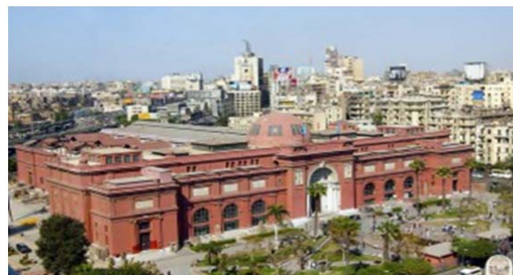
Fig. 7 Egyptian Museum in Tahrir Square [12]

Several objects have been recovered, such as; the statue of king Akhenaten was found within the trash close to the museum, broken wooden sarcophagus, different artifacts were discarded near to the museum, and other four statues were regained by police men's action [12]. The attack on the Islamic Art Museum in Cairo in 2014 resulted in destroying many valuable pieces and unique artifacts (Fig. 8). Additionally, the attack on the National Museum of Malawi in the city of Menia at Upper Egypt in 2013 resulted in looting all artifacts and collections. The robbers destroyed about 48 artifacts and looted about 1041 pieces, about 600 pieces have been recovered, and many efforts have been made to regain the other looted pieces [8].