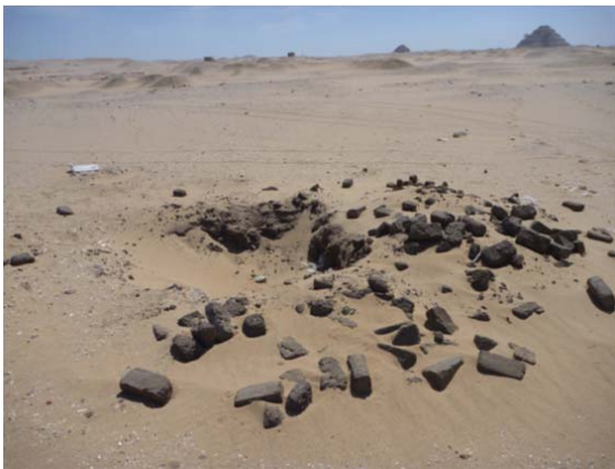
Fig. 6 Holes left by looters in Abusir, Egypt