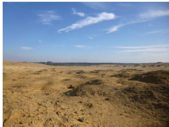
Fig. 2 Piles of debris left by looters in Dahshur

The Antiquities Law No. 117, 1983 indicated to preserve antiquities and protect the archaeological sites. The Egyptian ministry of antiquities conducted a strategic plan in order to preserve the monuments and develop the monumental sites of Giza, Saqqara, and Dahshur in cooperation with local society, official executives, and site management [2].