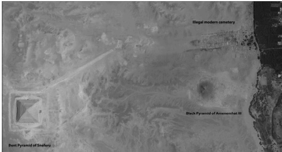
Fig. 4 Google Earth image of the illegal cemetery/looting at Dahshur, January 2015