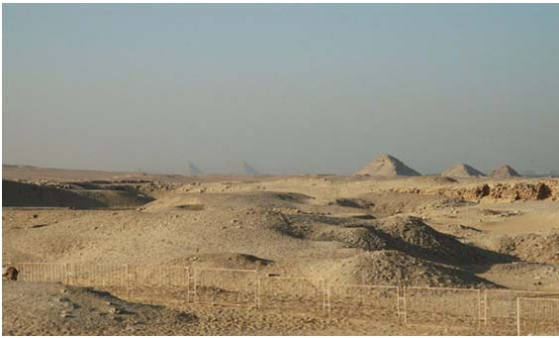
Fig. 1 The monumental area showing the pyramids of Giza and Abusir

persons. The robbers illegally excavated in the archaeological sites, and they made holes and tunnels that are visible on Google Earth. This random action was leading to destroying the stratigraphy and losing the documented site information [7]. For example, the archaeological site from Giza to Dahshur and Abu Sir had been attacked after 2011 (Fig. 1). The looters illegally excavated in the monumental area, searching for the monuments and valuable artifacts. This region is rich with archaeological material, and the site was classified in the World Heritage List in 1979 [8].