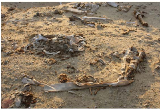
Fig. 5 Human remains and pottery scattered from a looted tomb in Abusir, Egypt