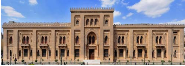
Fig. 8 The Museum of Islamic Art in Cairo was damaged by a bomb in 2014. It reopened in January of 2017.

Many efforts had been made to regain all artifacts and restore the destroyed pieces. Then the looted artifacts were recovered, and the other monumental objects have been restored as preparation to re-open the museum. [7]. As well as the arson attack on the Egyptian Research Council in 2011 resulted in destroying about 10,000 rare books, damaging more than 20,000, and the remaining archives are still unknown [13]. Furthermore, the attack on the Villa Casdagli in 2013 Simon Bolivar Square in Cairo downtown led to damaging the monument, as well as the Villa Kevork Ispenian on pyramids road in 2012 [14]. According to the World Bank and International Monetary Fund (IMF), there is a direct relationship between world heritage and tourism growth, leading to increasing the long-term GDP growth [15]. The world heritage does not only raise the economic value of the monuments, but it also has to be provided with international protection for the cultural heritage, and the local country's culture and tradition [16]. This protection is represented in preserving the country's cultural heritage and historical landscape, regardless of the new modern constructions that have been built over the original ones [17].