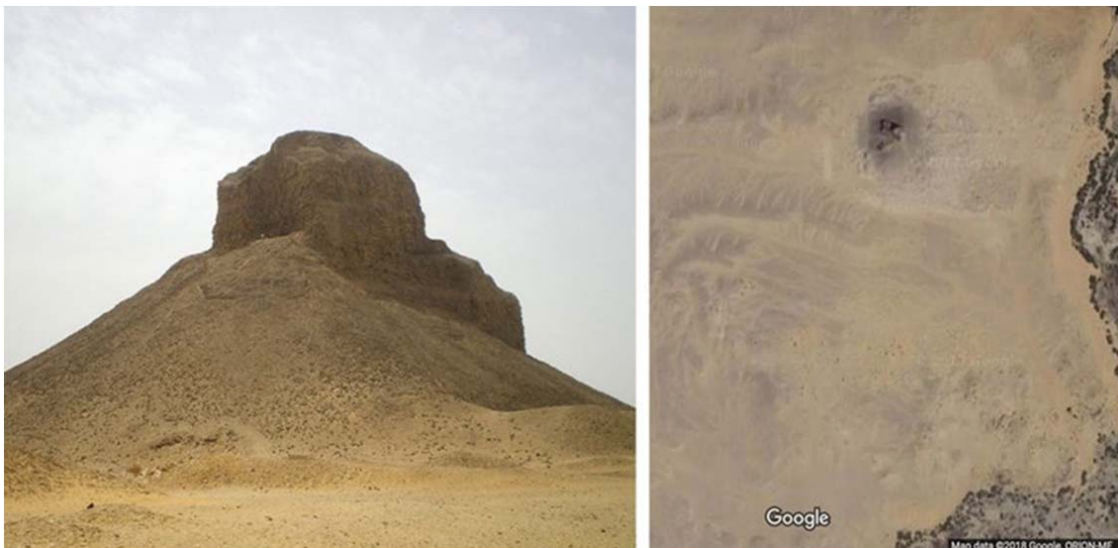
Fig. 3 The illegal excavation near the pyramid of Amenemhat III at Dahshur, (photo: Tekisch, CC BY-SA 3.0)