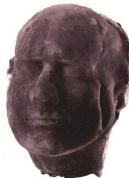
Fig. 6 Marc Quinn, 1991 'Self' (sculpture) New York

For several years he had been collecting and keeping his blood in the fridge, then filled in the form of his head, created a self-portrait. For creating this figure he used blood approximately by volume equals to the blood of a man of average years. This is stored in the New York Museum of Modern art. Thus, taking medical analysis of human DNA contents, which is the achievement of genetic engineering artists began to create their works of art. Also the huge interest is arisen to the biological nature of man to his particular ancestor history and personal characteristic features. In general, a modern work of art has squeezed its artistic scope and start brining information from different areas of anthropological sciences. In such situations a character perceiving and creating as an object becomes the subject and is grouped, and is perceived as a literary text around a man.