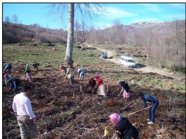
Fig. 3 Weed control through labourer power, and a view from soil processing