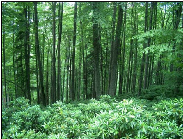
Fig. 1 Artificial regeneration area, where the weed control will be executed

The study area is 10 ha in size, 935m in altitude, it has northwestern exposure and is located in central shoulder, and it has characteristic of ruined coppice beech forest. After weed control in area, it is planned to prepare the discrete terraces in 3x2m dimensions, and to plant 2+0 naked-rooted saplings originating from Kdz. Ereğli in 3x1.5m distances between each other (Fig. 1).