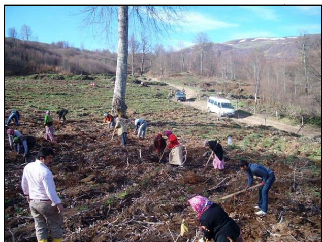
Fig. 3 Weed control through labourer power, and a view from soil processing