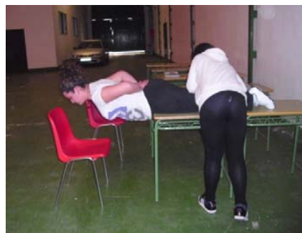
Fig. 3 Sørensen Test

The participant laid down in a prone position over an examining table with the arms folded across the back. An assistant helped to hold the lower body against the examining table. The participant was asked to maintain the upper body in a horizontal position, aligning the upper edge of the iliac crests with the edge of the table, until they could not hold the position any longer. The test should be stopped at 240 seconds (Fig. 3).