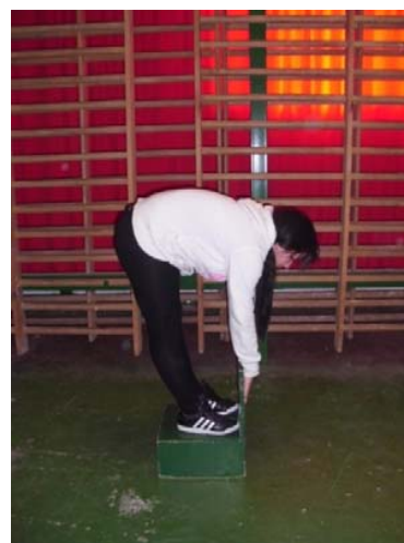
Fig. 4 Toe-touch test

This test measures hamstring flexibility. To perform the test, the participant stood over a box with knees and feet shoulder width apart. They performed a maximal trunk flexion without bending the knees and with arms and palms outstretched over the ruler of the box (Fig. 4). The zero-point was in line with the edge of the box. Values above the zero-point were considered negative, while those below it were positive. All measures were registered in centimeters (cm). We consider normal values those higher or equal to -5 cm. Values between -5 cm and -12 cm were considered as having hamstring shortness type I, and values lower than -12 cm were considered having hamstring shortening type II [29].