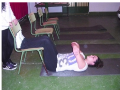
Fig. 1 BTC Test. Starting position

The number of complete cycles was registered.