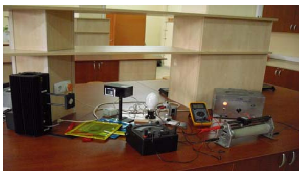
Fig. 2 Real experimentation materials regard photoelectric effect

The physic achievement test was applied again to the experimental and control groups as a post-test. The SPSS 11.00 (Statistical Package for Social Sciences) statistical program was used to evaluate all the data collected from pre-and post-tests. The independent samples t-test, one way anova and tukey hsd test were used for testing the data obtained from the study at 05 level of significance.