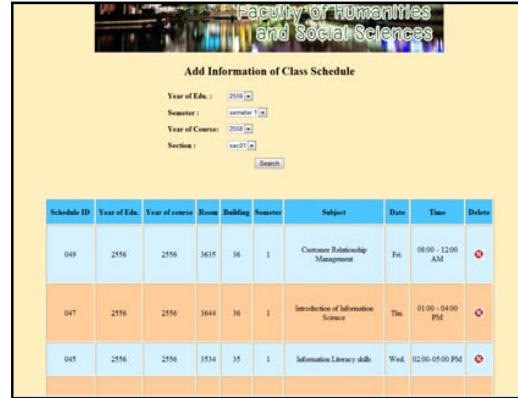
Fig. 3 Timetable Management System Details of the Timetable by Selecting the Data to Match with User Requirements