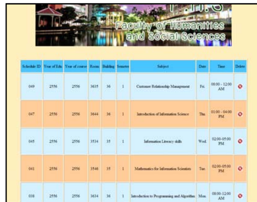
Fig. 5 Timetable Management Result System to Process Timetable from Users (Managed and Display Results)