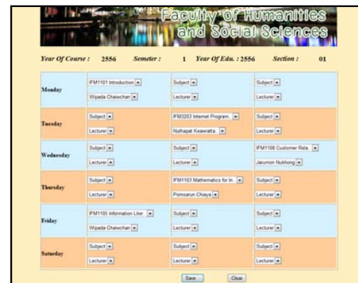
Fig. 4 Timetable management system Users are instructor can set and manage timetable by themselves