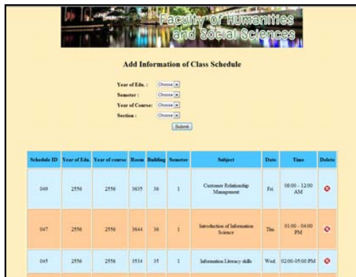
Fig. 2 Timetable Management System Details of the timetable by selecting the data to match with user requirements

The development of the online class scheduling management system by Webbased Application develops program using PHP language and database system using MySQL in the working process of the application of this system can provide several instructors to schedule simultaneously. Therefore, instructors can manage timetable by themselves, and check their timetable with searching and students can check and also publish a timetable and download other documents associated with the system immediately online. To fix the timetable, it is complicated and must be considered several factors depending on conditions and the number of courses. This also depends on the physical characteristics of each class. It will be much easier to change from manual to online one. New technology allows all users to save more time and ease their lives.