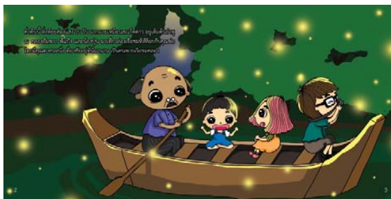
Fig. 3 Pictures in pages 2-3

8 visual images which were later applied to 1 illustrated children’s book.