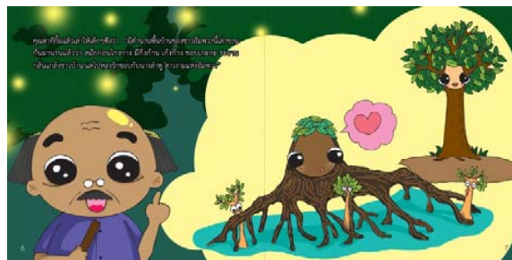
Fig. 5 Pictures in pages 6-7

“Little fireflies emitting light at night inspired imagination which led to the story of Ampawa Fireflies.”