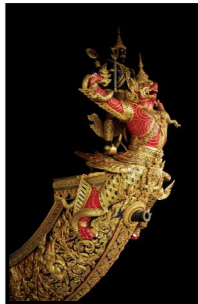
Fig. 2 The Royal Barge Narai Song Suban Ratchakan Thi Kao

Recently of the figurehead either Royal Barge and Royal Yacht were launched in the beginning of Rattanakosin Era for example; The Krabi Prab Muang Marn Barge, The Krut Hern Hed How Barge and The Krut Tret Traichak Barge. Only the body of each barge was rebuilt and was kept at Wasukri Pier which also includes The Royal Barge Narai Song Suban that constructed in the reign of King Rama III and launched on his Garuda in the reign of King Rama IV. In year 1996 which was the fiftieth anniversary of Bhumibol Adulyadej's accession to the throne, the King Rama IX was mandated to launch the new one of The Royal Barge Narai Song Suban by using the original figurehead. However, the original figurehead was excessively heavily therefore, The Royal Barge Narai Song Suban was rebuilt and renaming to "The Royal Barge Narai Song Suban Ratchakan Thi Kao" [5]-[9].