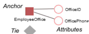
Fig. 1 Visual representation of anchor model's components