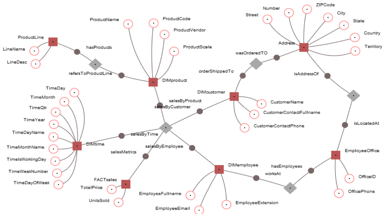
Fig. 4 Initial STAR schema converted into a more decomposed anchor model

information as the default STAR schema and the AM_LESS schema. Table II shows short characteristics of all 3 database schemas after filling database tables with test data.