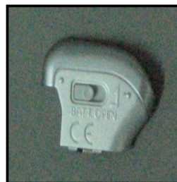
Fig. 1 Canon B. battery lid product

A new approach in designing of semiconductor equipment based Queuing Theory to reduce cycle time. They applied Queuing Theory in calculating optimum batch size for their processing equipment. They have showed the batch size required to achieve short time under different production situations [1].