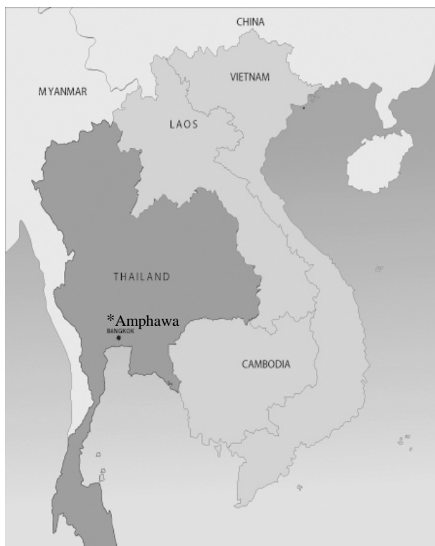
Fig. 1 Location of Amphawa, Samut Songkram

agro tourism, natural tourism, and religion and cultural tourism. Especially, in the core area of Amphawa is the critical area for firefly watching, appreciation way of life, floating markets and sightseeing along canals. Therefore, the development of tourism in Amphawa is increasing rapidly while several environmental impacts have appeared. More than 112 homestays and resorts have been developed in Amphawa (Fig. 2) [3], especially along the riverside. The mass tourists at Amphawa floating market can generate income to local people however tons of waste and wastewater have been generated by tourists, respectively. Light from the expansion of the municipal area, resorts, and tourism activities also affect mating behavior of fireflies. In addition, water consumption of tourists during weekend also creates water shortage in Amphawa as well as wastewater from tourist accommodations can also discharged through natural environment if with or without wastewater treatment system.