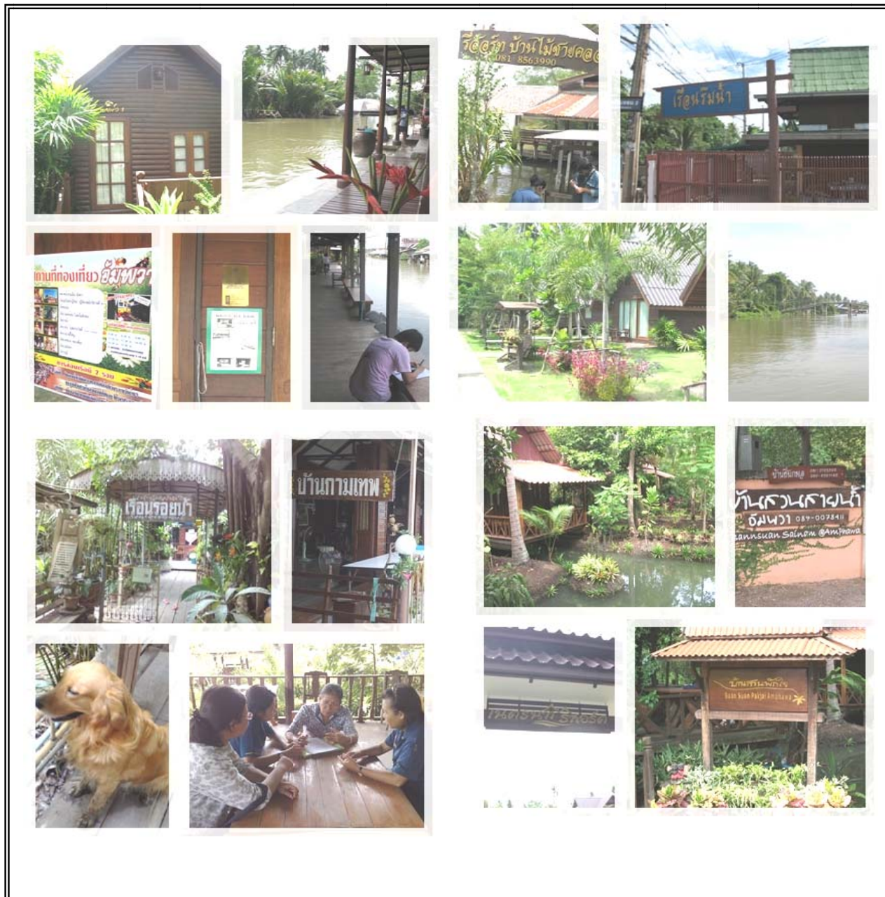
Fig. 2 Tourist Accommodations in Amphawa

Moreover, the location of tourist's accommodation is situating nearby the riverside, where is very sensitive to discharge wastewater, waste, chemical pollutants to natural water resources may occur if there is a lack of appropriate environmental management system. Therefore, this study aimed to initiate sustainable water management for tourist accommodations in Amphawa, Samut Songkram Province by evaluated wastewater characteristics from 10 tourist accommodations. Implementation of this study can be applied the mitigations to reduce contamination of water resources and protection natural resources which are the great assets for local