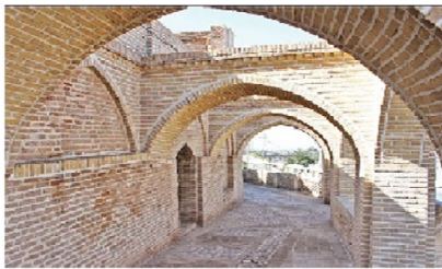
Fig. 4 Sabat in a hot-humid city in Iran

Iranian architects in some instances built houses up to somewhere lying on the lane and began to build one or more protruded rooms with same eaves above the passage all commuting was made under these rooms called Sabat. In some cases they are as single rooms over the narrow alleys. Sabats improve the stability of the houses and make neighbors more close to each other [3], [10].