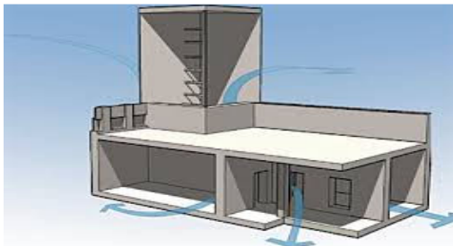
Fig. 2 The flow of air in different rooms