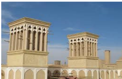
Fig.1 Wind catchers that have more than one side facing the prevailing wind

The tower head may have vents on only one side facing the direction of the cooler prevailing wind [1], [9]. However, two or four sides of the tower might be open to accommodate wind in all directions. Fig. 1 shows wind catchers with more than one side facing the prevailing wind. The tower would be subdivided, respectively, into two or more groups of shafts. This subdivision allows air to move separately up and down the tower at the same time and provides more surface area in contact with the air. Consequently, the breeze is drawn and is diverted to the summer living zone. Air caught in the vent is channeled down through a shaft in the building into the rooms below which are cooled and ventilated [1], [2]. Fig. 2 shows how a wind catcher ventilated different rooms in a house.