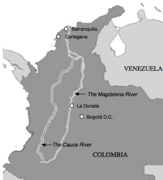
Fig. 1 The Magdalena River

This paper is divided into four major sections, briefly an overview of the Magdalena's river situation and the river's investment project, followed by description of the methods used, the research results, recommendations and finally conclusions.