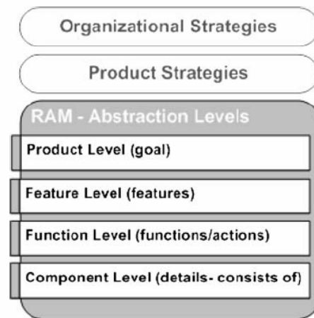
Fig. 1 Requirements Abstraction Model (RAM) Abstraction Levels [7]

The last level in the RAM model is the Component Level. Requirements at this level have detailed information. Component level requirements generally describe how a problem is to be solved. An example of the component level requirement from the CMS system is "If the user enters an incorrect user id and /or password the login page shall be reloaded with information showing that an incorrect login has been attempted".