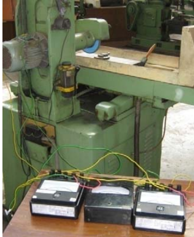
Fig. 1 Experimental setup