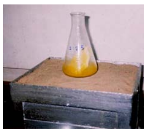
Fig. 2 HCl Dissolution of Hydrous Metal Oxide Cake