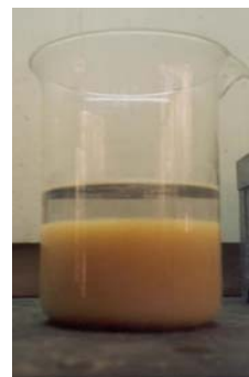
Fig. 3 Precipitation of Rare Earth Hydroxide

The acid solution (filtrate from Hydrochloric Acid dissolution) was precipitated with ammonium hydroxide. Other associated minerals hydroxide was precipitated at pH-5.8, and rare earth hydroxide was precipitated at pH-11. The rare earth hydroxide was dried in the drying oven at 100°C for one hour. After that, it has yellow color. Precipitation of rare earth hydroxide, fourth stage of flow diagram, is shown in Fig. 3.