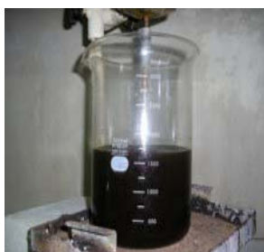
Fig. 4 HNO 3 Digestion of Rare Earth Hydroxide

To remove medium rare earths and heavy rare earths, the rare earth oxides after cerium removal was digested with nitric acid and diluted with water. The digestion of rare earth oxide with nitric acid, stage five of the flow diagram, is shown in Fig. 4. At this stage the color is red brown. Then the solution was precipitated with ammonium hydroxide at about pH-6.9-7. After precipitation, filtration was carried out. The precipitate is medium and heavy rare earth hydroxides and the filtrate was used for precipitation of other rare earths.