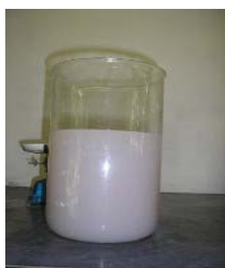
Fig. 5 Precipitation of Lanthanum

After removal of other rare earths, the solution was precipitated with ammonium hydroxide at pH-7.9, lanthanum hydroxide was obtained. Then filtration was carried out. The filtrate was then precipitated again at pH-9.6 to get more purify lanthanum oxide. After adding these two precipitates at pH 7.9 and 9.6, this precipitate was digested again with nitric acid. The precipitation of lanthanum hydroxide, stage seven of the flow diagram, is shown in Fig. 5. Then selective precipitation was made according to the above procedure in order to obtain high purity of lanthanum oxide and the precipitation was carried out about three times.