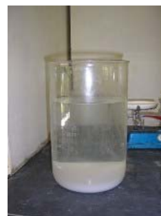
Fig. 6 Lanthanum Oxalate after Three Times Precipitation

6. Lanthanum oxalate was obtained and calcined at 1000°C. Then 96% of lanthanum oxide was obtained. It has white color.