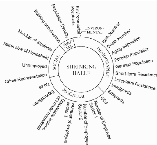
Fig. 2 The concept structure of variables of shrinking Halle

In summary, we initially established a comprehensive evaluation variable system of Halle’s shrinkage (Fig. 2).