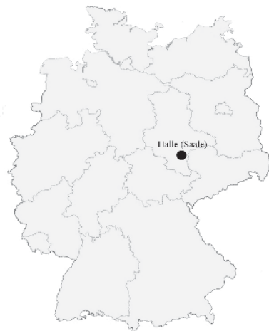
Fig. 1 Location of city Halle an der Saale in Germany

Halle an der Saale, once famous for its salt, was a center of the GDR's chemicals industry and one of the important regional cities (Fig. 1). It was considerably enlarged by the construction of Halle-Neustadt (Halle New Town), which began in the mid-sixties. By 1990, about 94,000 people lived in the new district's pre-fabricated blocks of flats, most of them are the families of workers in the area's large chemical combines. The total population of the city Halle and Halle-Neustadt increased to 309,406 inhabitants in 1990.