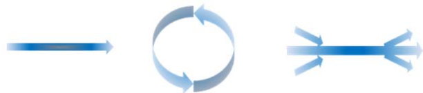
Fig. 2 Three characteristics of time

The diagram is best known by the general public in the form of musical notation. In addition, dance notation, electronic schematic, map and so forth are diagrams systematically recorded. Diagram is a convenient tool for man to not only read activities of creation, but also to participate, give feedback and document experience from past events [7]. Continuous time factor connects a series of experiences from events in the order of time, thus combining the interactions in time and space. Therefore, diagram is related to time factor. "Time" is an integral part in human society. Individuals schedule their daily lives with respect to time. For groups in a society, the changes in culture and living environments are all documented and expressed in terms of time. In other words, due to the characteristic of time we are able to understand and express the changes of all things. Many characteristics of time are often conceptualized into a Timeline in which time always advances forward. Such is called a Linear Time. However, linear time is not the best way of expressing cyclic activities, such as those of daily and weekly life patterns. Thus, Cyclic Time becomes another way of expressing time. Furthermore, various assumptions often appear in a long term study and plan. In such a case, Branching Time is required to handle different tracks of segment. The three characteristics of time are shown in Fig. 2.