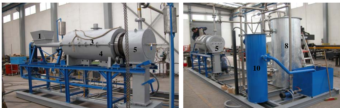
Fig. 2 Photographic views of the pilot plant (numbers are the same as Fig. 1)

jacket; this gas is produced during the plant starting up phase by LPG burners. The reactor internal temperature is maintained at a constant temperature near 500°C by a control system that regulates the flow rate of the gas sent to the burners. The pyrolysis gas coming from the reactor passes through an area of calm, where most of the inert particles and biochar are separated and discharged by means of a double dump valve (system 5 in Fig. 1 and 2). Then the gas is sent to a cyclone separator (6 in Fig. 1 and 2) where the residual solids are separated, after which it is cooled with water by an adiabatic quench system (apparatus 7 in Fig. 1) and purified into a wet scrubber (8 in Fig. 1 and 2); finally, after having passed through a flow device (10 in Fig. 1 and 2), the produced gas comes out to be burned. The conveying of the pyrolysis gas is made by a side channel blower (9 in Fig. 1 and 2) positioned in the process line between the scrubber and the flow device; it is regulated in such a way that the reactor is maintained with a slight depression (3-5 mm of water column).