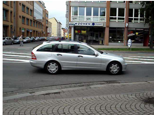
Fig.3 Authenticated frame using the proposed technique. Correlation coefficient=0.9998, PSNR=46.64 dB.

Assume that an attacker removes an object from the authenticated video and places, instead of the removed object, adjacent blocks coming from another authenticated area. Fig. 2 is the original frame and Fig. 3 is the authenticated version. The computed peak signal to noise ratio PSNR and correlation coefficient between the original and authenticated frames are 46.64dB and 0.9998, respectively. In Fig. 4, the car object is removed and precisely replaced by a background coming from another authenticated frame without introducing