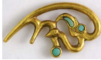
Fig. 8 The metal plate called "golden eagle"

Comparing all known images of eagles, it is possible to make the following conclusion. Eagle from the mound number 1 of burial Shilikti-3 is the most advanced, the earliest of all known images of the eagle sewn on plaques Saka-Scythian cultural and ethnic community.