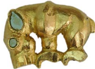
Fig. 9 The metal plate in the form of wolf-cub or bear-cub

The decoration in the form of a wolf (bear) is of great importance (Fig. 9). In this decoration an image of predatory animal's baby is shown. The head and nose just reminds new born wolf cub. However, the body, feet, tail resemble a bear cub. The images of creatures that combine the features of a wolf and bear were encountered in the Scythian-Saka fine arts before. On the back the ornament has two buckles.