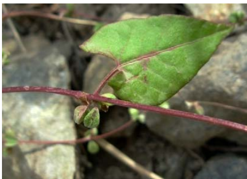
Fig. 4 Fallopia convolvulus (L.) A. Löve

The genus Fallopia includes 2 species: F. convolvulus (L.) A. Löve (Fig. 4) and F. dumetorum (L.) Holub (Fig. 5). F. convolvulus occurs in all floristic regions of Armenia, while F. dumetorum occurs only in Ijev. and Dar. floristic regions. The main differences between these two species are absence/presence of wings on the perianth, mate and glossy fruits respectively and the articulation place of peduncle-perianth.