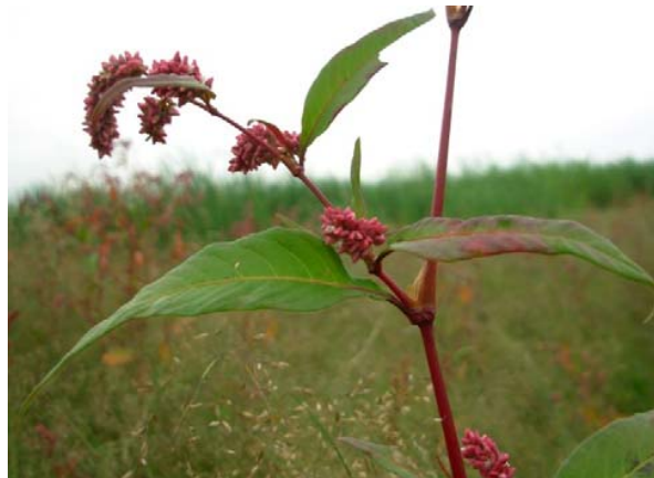
Fig. 6 Persicaria lapathifolia (L.) Gray

Two species, registered in "Flora of Armenia" - Polygonum nodosum Pers. and Polygonum tomentosum Schrank we accept as the same species and include in polymorphic and systematically difficult species Persicaria lapathifolia (L.) Gray. (Fig. 6), which occurs in Lori, Ijev., Apar., Sevan, Yerev., Dar., Zang. and Meghri floristic regions.