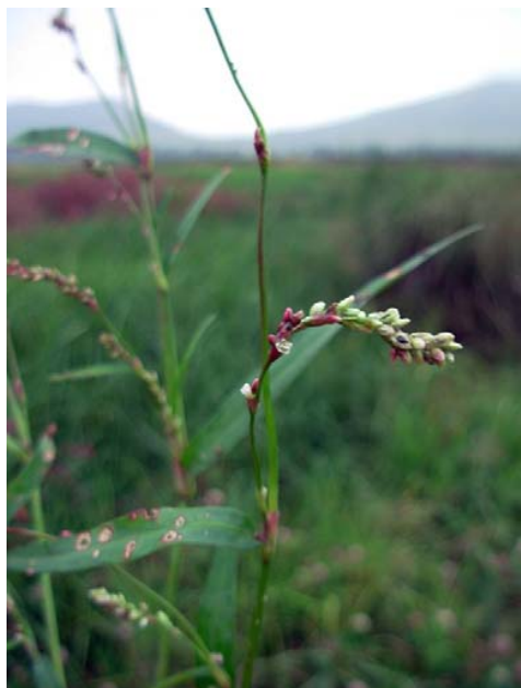
Fig. 7 Persicaria minor Huds. (Opiz.)

We didn't find any specimen of Polygonum arenarium Waldst. et Kit. from Armenia, so this species is excluded as well.