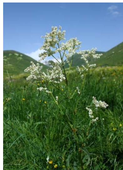
Fig. 2 Aconogonon alpinum (All.) Schur

Polygonum alpinum All. is removed to genus Aconogonon and renamed to Aconogonon alpinum (All.) Schur (Fig. 2). It is distributed in all floristic regions of Armenia [9] (Fig. 1).