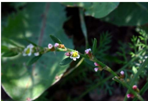
Fig. 8 Polygonum arenastrum Boreau

We had difficulties to understand what is P. aviculare L., as the descriptions of the species were different in different literature. It came out, that the species, called P. aviculare on the territory of USSR was accepted in western countries as P. arenastrum Boreau (Fig. 8). According to decision of International Committee of Plants Nomenclature the name P. aviculare is left for the heterophyllous species, which was accepted as P. heterophyllum on the territory of USSR [10]. Our investigations showed, that only P. arenastrum occurs in Armenia in all floristic regions.