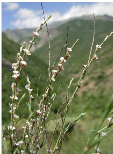
Fig. 9 Polygonum setosum Jacq

2 mm), which we don't accept as a species determining feature. The species can be found in Apar., Dar., Zang., Meghri floristic regions.