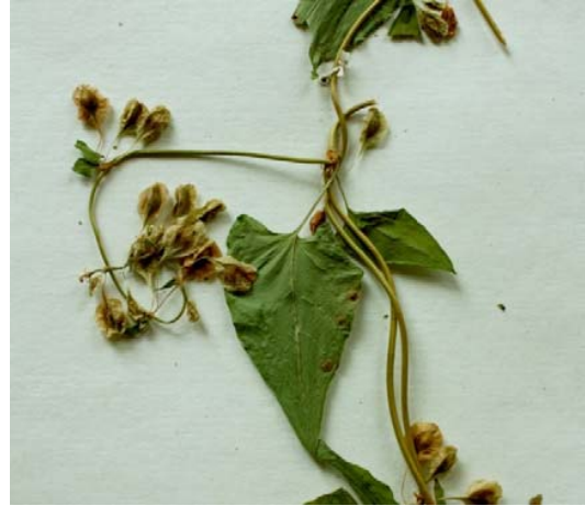
Fig. 5 Fallopia dumetorum (L.) Holub

The genus Persicaria includes 5 species, previously included in section Persicaria Meisn.: P. amphibia (L.) Gray, P. hydropiper (L.) Spach, P. lapathifolia (L.) Gray, P. maculata Gray and P. minor (Huds.)