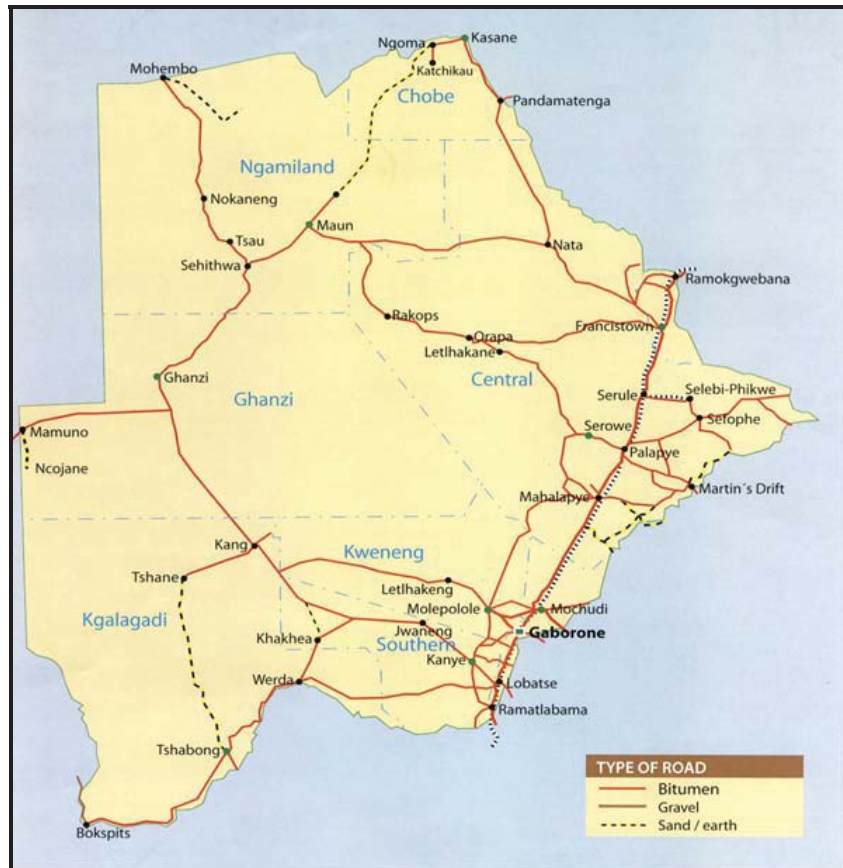
Fig. 3 Map of Botswana