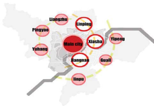
Fig. 1 Analysis diagram of Hangzhou future urban planning group (self-painting)

The author describes the distribution of rental-type public housing projects that can be accommodated at the city level in Hangzhou by 2018 as shown in Fig. 2. At the macro level, it is concluded that the distribution of rental-type public housing is characterized by suburbanization and distribution.