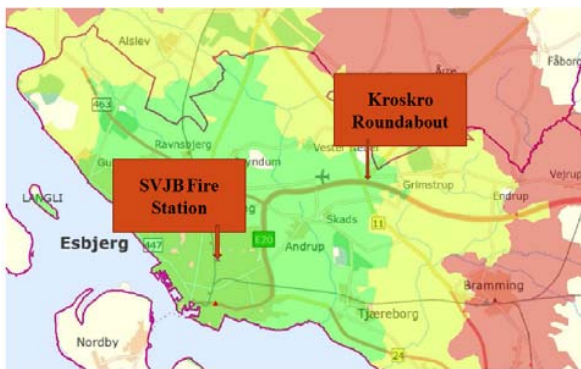
Fig. 1 Esbjerg Fire Station Response Time [8]

According to the fire station responsible for Esbjerg emergency services, Sydvestjysk Brandvæsen (SVJB), the Korskro roundabout on the outskirts of Esbjerg, a town located on western coast of Denmark, is prone to frequent traffic accidents. On average, 5-7 accidents per year are recorded on this roundabout. This paper analyzed the use of RED at a hypothetical traffic accident at Korskro roundabout. Response time is a critical factor in saving lives and FARS tries their best to reach the scene of accident in the fastest time possible. The response time from the Esbjerg fire station and the outskirts of the town is depicted in Fig. 1. The green area in Fig. 1 shows a response time of 10 minutes, while the yellow area represents 15 minutes of response time. According to the figure, the accident site of Korskro roundabout is in the green area and has a minimum response time of 10 minutes.