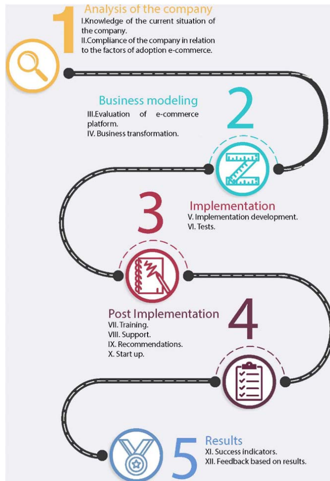
Fig. 1 Reference Model for the Implementation of an E-commerce Solution in Peruvian SMEs in the retail sector (MISEP)