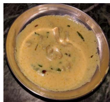
Fig. 5 Sample 1 in kadhi preparation