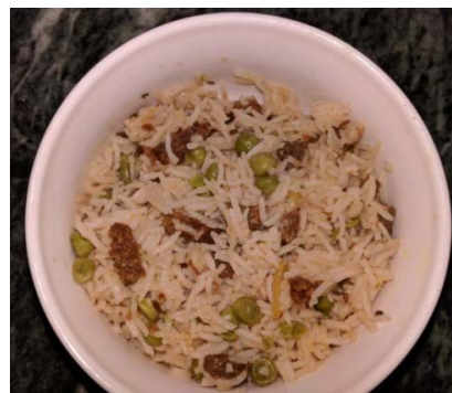
Fig. 4 Sample 1 in pulao preparation

The acceptability of the product by the target population is an important factor in determining its market viability. The samples were evaluated by 102 consumers for appearance, taste, colour, texture, aroma, and over acceptability. The product was rated on 5-point hedonic scale. Fig. 3 shows consumer preference responses. Both samples were accepted in their end preparations for colour, flavour and aroma, texture and consistency, after taste and overall acceptability. Colour of Sample 1 in kadhi and Sample 2 in potato curry preparation was excellent whereas Sample 1 in pulao was very good. Consumer preference trials showed great potential of the product as it was highly accepted by various age grouped individuals. Figs. 4-6 show developed chunks in their end use preparations.