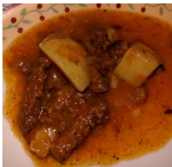
Fig. 6 Sample 2 in potato curry preparation