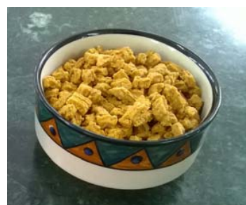
Fig. 2 Developed Ready-to-Use chunks

Ash content obtained for Sample 1 and Sample 2 was 2.86%. Total ash content, percent by mass, max. should be 5.0%. The present products confirms to above specification [1].