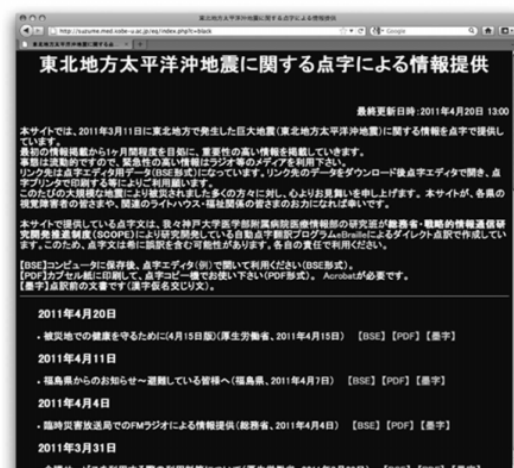
Fig. 3 Our portal site for the sufferers of Tōhoku earthquake and tsunami