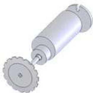
Fig. 2 Original redesigned control mechanism