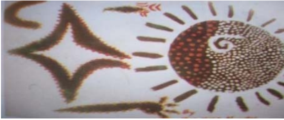
Fig. 13 Uli Wall Motif (Heavenly bodies: star, moon and sun)

Wall engraving is considered too strong for women (some strong women do the engravings themselves). Men sometimes do the engraving while the wall is still wet and the women continue with the drawings after the wall is dried. The dyes for wall art are collected from wide variety of sources, ranging from vegetables and plants to earth and stones. Any dye can be used for wall art provided it is vivid and brilliant. Colours for the wall are black, white, red, brown, yellow, ochre and purple or dark blue (Figs. 12 & 13) [11].