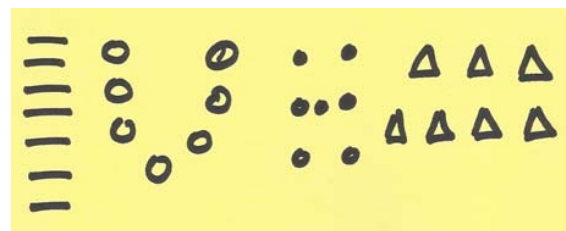
Fig. 11 Number Seven (asaa)

Motifs for murals are derived from animals like egune snail (Figs. 6 & 7), plants like omu nkwu palm frond (Figs. 8 & 9), numerical units ise and asaa five and seven (Figs. 10 & 11) and mural drawing tools. They can also be taken from cosmic elements like sun, stars and moon. They could be symbols that only the 'learned' understand. Many more are simple motifs with no meaning attached to them but are equally beautiful.