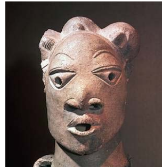
Fig. 1 Nok Terracotta Head

individuals; groups or the entire community; and to execute judgment [1]. Masks and masquerades are very significant and are used in different forms of worship, rites and ceremonies. Wall arts are highly valued for their aesthetic values and sometimes used to pass information or communicate to individuals or the community [1]. Sadly, these arts are speedily dwindling into extinction. The merciless culprit of this swift delve into extinction is modernization. This culprit led to theft or looting of these figures, destruction and discarding of these highly priced arts and abandoning the production and practice. Old traditions have great value and it is a pity that modern times often neglect previous artistic and cultural achievements. In a way, it probably has to be so, but at the same time, the preservation of at least a number of examples of earlier traditions is priceless. It is thus necessary to preserve this priceless heritage even in the mist of modernization.