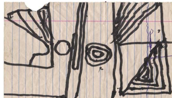
Fig. 16 Eselese

Most artists are now too old and can no longer do the work. An eighty-seven year old Mama Nnama of Umunze in Anambra state could not make small body drawing patterns on a paper with pencil when asked to do so. Not until she was given a bold marker pen and paper before she could draw eselese patterns (Fig. 16) [11].