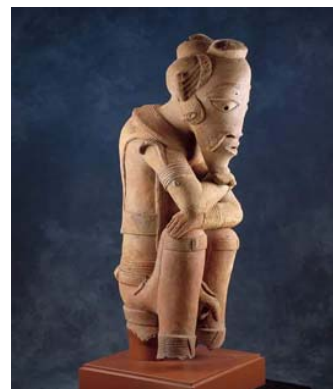
Fig. 2 Nok Terracotta Seated Figure