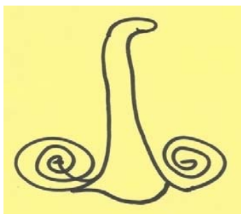
Fig. 7 Snail (egune)