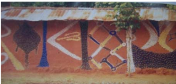
Fig. 14 Iyi Azi Wall

Red sand upa and anthill are collected for extraction of red pigment. Unlike body decoration, wall designs are bold with brighter colours. The drawings are adapted from natural objects and also from manmade objects as well. More freedom and choice of theme and design are involved in wall decoration and painting than in body decoration [13].