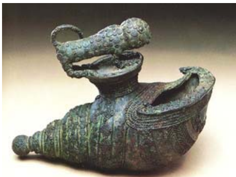
Fig. 5 Igbo-Ukwu Art Object