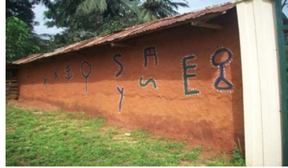
Fig. 15 Chief Gabriel Madichie's Wall (Complete Mural)

In preparing the wall for drawing, cracks on the walls must be filled and completely covered with red sand. Next step is the coating or priming of the wall with one colour, preferably red soil or charcoal. After about four days, the wall is dry and coconut shell is used as sand paper to achieve a smooth and glossy surface. Bold patterns are put in first, followed by smaller ones. Dark or black colour may be used to outline the designs. One of the traditional muralists, Mama Ekema says that she personally preferred using black as the background colour for it brings out any colour of design made on it [11], [12], [13].