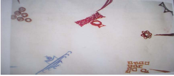
Fig. 12 Uli Wall Motif (numbers, heavenly bodies and man-made motifs)