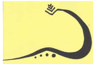
Fig. 9 Palm Fronds (omu nkwu)