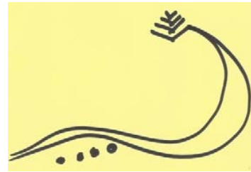
Fig. 8 Palm Fronds (omu nkwu)