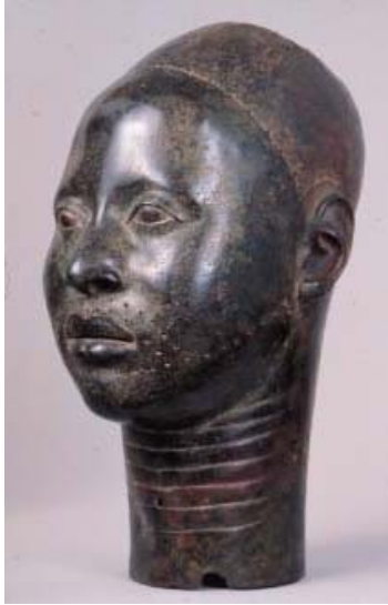
Fig. 3 Ife Bronze Head