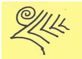
Fig. 6 Snail Movement (ire egune)

Below are some mural drawings made by those traditional female muralists: