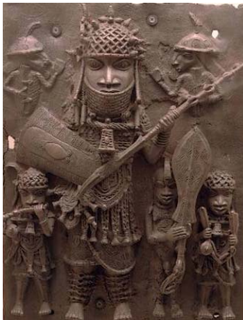
Fig. 4 Benin Bronze Plaque