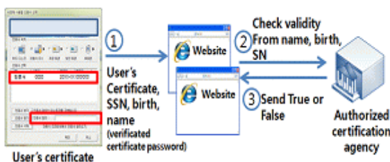
Fig. 3 Certificate authentication using birth

However, it would be more important to minimize the request for identity verification by reviewing if identity verification is needed. It would be also necessary to cooperate with related agencies for verifying the personal identity without using the RRN. It is also necessary to seek other types of means