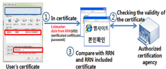
Fig. 1 Certificate authentication using RRN

The certificate authentication uses the hash value of the RRN stored in the certificate. The identity of the user is verified in the following process: ① the password for the certificate (passphrase for the private key) is entered, R (random sequence of numbers with a specified number of bits) is extracted from the decrypted private key, and R and the certificate are encrypted and sent to the web site; ② the validity of the certificate is proven by an authorized certification agency; and ③ VID is generated based on the RRN stored on the web site and the received R value ( R \circledast \text{RRN hash} = \text{VID} ) and compared with VID generated based on the hash value of the RRN and the R value ( R \circledast \text{RRN hash} = \text{VID} ) [9]. The authentication based on the certificate has the advantage of high safety and reliability because it confirms the personal identity using the passphrase that the user has and the certificate but requires for the RRN.