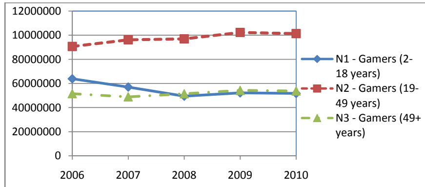
Fig. 1 Age-structured Game Playing Population