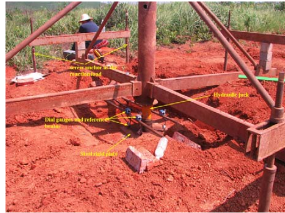
Fig. 1 The arrangement of the plate load test

used to measure the settlement. Average of the four dial readings is taken as the settlement of the plate corresponding to the applied load. When the rate of average settlement is less than 0.01 mm per two hours, load is then increased to further preset load, and the load and average settlement readings are noted as before.