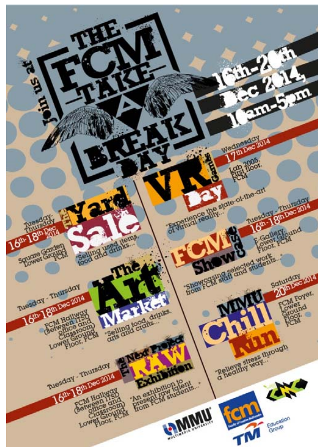
Fig. 3 FCM Take A Break poster

Overall the students managed to overcome all the challenges in managing the FCM take a break week. Based on the overall overview from the lecturers the students had done a good job in making sure that the event follow it schedule and works accordingly. The students reports on their overall performance and they learnt a lot in term of communication skills and marketing skills. Knowledge transfer and sharing happened during the event when they need to communicate with different authority in MMU and Cyberjaya society.