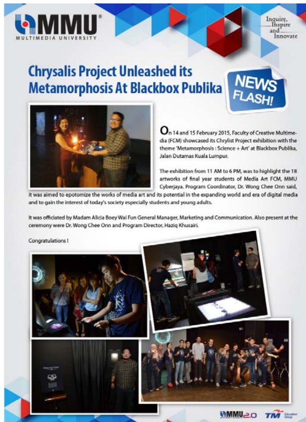
Fig. 4 New on Media Art Exhibition

Fig. 4 shows the media art showcase as one of the event runs by project management students. This event showcases the final year students' project for Media Art students. The students from project management class in Media art specialization were assigned to handle the showcase from planning, invitation, facilities and the overall running of the event. The event was held at Blackbox, Publika and the rental was sponsored by MMU. The students were exposed to task like setting the site for the showcase where they have to decide what facilities needed for each of the project showcasing at Blackbox, Publika at Damansara, Kuala Lumpur, Malaysia.