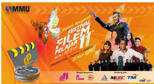
Fig. 2 Student Film Festival (FFM '11) poster

The students enjoyed themselves organizing and managing the events as well as to participate in the festival itself. It gives them an extraordinary exposure to deal with people from all the universities, colleges, community colleges from all around Malaysia. It gives them a new horizon on how other students from other university works in term of developing and implementing creative ideas in multimedia creative environment. The sharing and transferring of knowledge happened in a very conducive environment for teaching and learning of students from higher learning institute like Multimedia University.