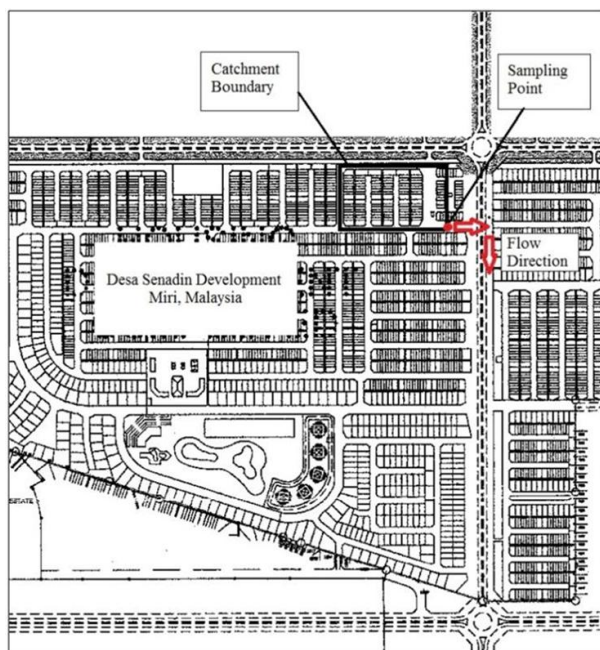
Fig. 1 Study site location within the Desa Senadin Development in Miri

Fig. 1 shows the catchment area under study and the sampling location. The land use distribution within the study site is shown in Fig. 2.