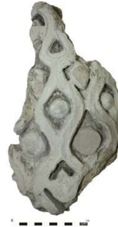
Fig. 49 Fragment of column body