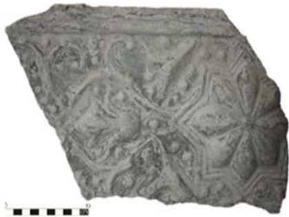
Fig. 19 Rosace motif placed in an octagonal star