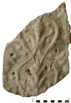
Fig. 20 Composition consists of stylized tulips.