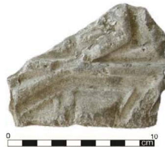
Fig. 32 Fragment with a geometric ornament (31-AL 2015)