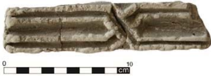
Fig. 44 Geometrical chain frieze (2015)