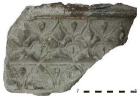
Fig. 25 Palmet serie with drops bewtween palmettes