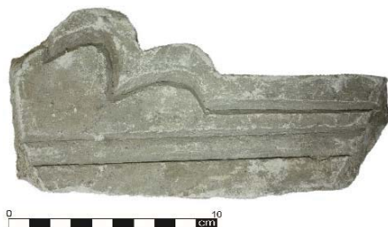
Fig. 36 Fragment of niche edges