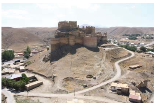
Fig. 12 Hoşap Castle from northeast in 2014 (excavation archive)