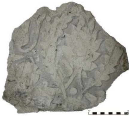
Fig. 18 Plain malacary technique