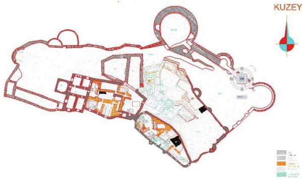
Fig. 1 Plan of Hoşap Castle 2012

It is mentioned that the ceramic finds of Hosap Castle published previously may have been imported from Iran [17]. It is much more difficult to make this determination when it comes to stucco material. Only with a detailed 17th and 18th century Iranian gypser art study can be reached to a definite conclusion. Because, when the historical background of Hosap Castle and the stylistic and motivational characteristics of the gypser art are examined the characteristics of the 17 th and 18 th century Ottoman capital are seen. Nevertheless, a more extensive and detailed investigation is needed for more accurate conclusions and discourses.