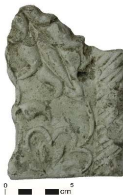
Fig. 39 Fragment of niche edges