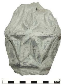
Fig. 47 Column heading