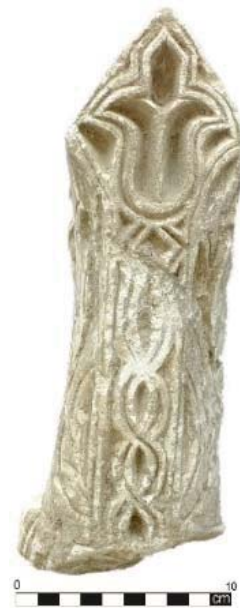
Fig. 33 Peak of a hood