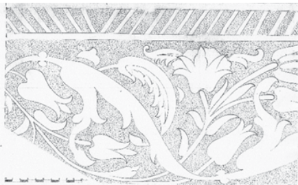
Fig. 3 Fragment has composition consists of tulips, carnations and leaves (excavation archive)