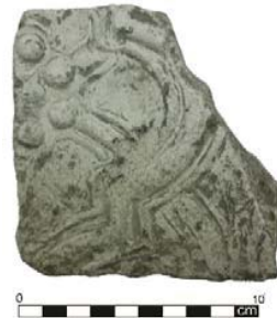
Fig. 23 Another quadrivial leaf arrangement placing at the core of an oval layout