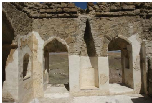
Fig. 14 Northwest room of harem plaster-decorated