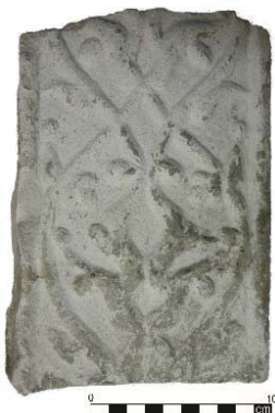
Fig. 21 Stylized tulip or palmette-like flowers