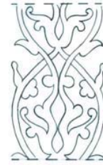
Fig. 5 Stylized tulip or palmette-like flowers (S. Taş)