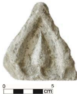
Fig. 46 Palmette-like broken fragments (31-AL 2015)