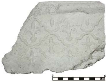
Fig. 26 Lily motif friezes