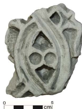
Fig. 42 Small piece with different ornamentation