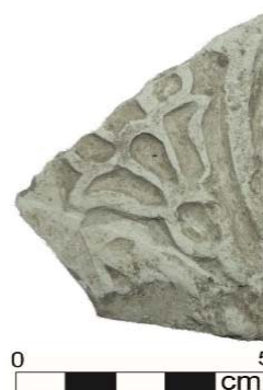
Fig. 17 Muzeyyen malacary technique (inside the motifs are also carved)