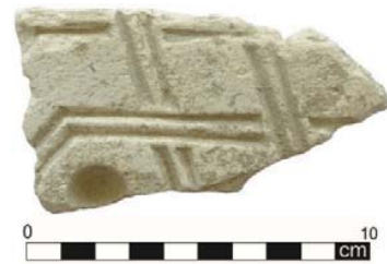
Fig. 30 Fragment with a geometric ornament