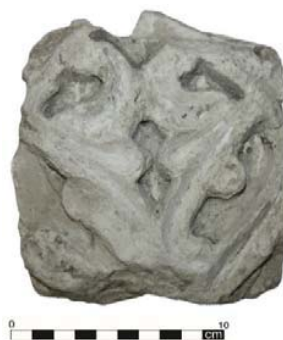
Fig. 41 Small piece with different ornamentation