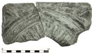
Fig. 34 Fragment of niche arches (2011)