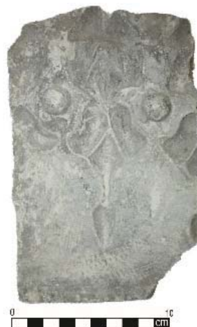
Fig. 24 Palmet series with a semisphere in their mid