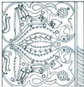
Fig. 2 Plaster plate that has been left in situ on the wall of northwest room of harem (S. Taş)