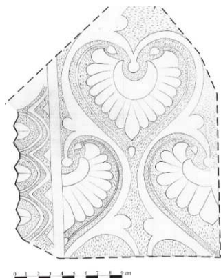
Fig. 10 Fragment with "athemion" (excavation archive)