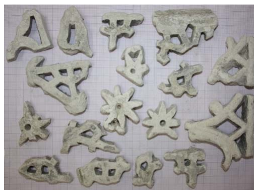
Fig. 40 Fragment of window