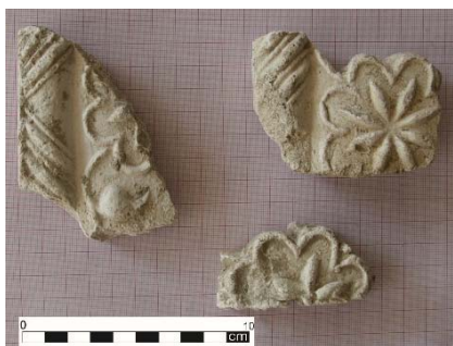
Fig. 38 Fragment of niche edges (31-AL 2015)