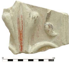
Fig. 43 Small piece with different ornamentation