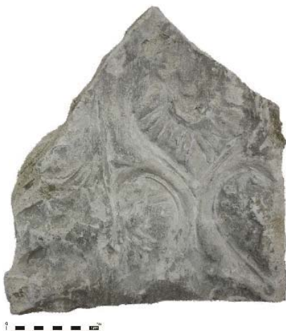
Fig. 28 Fragment with "athemion"