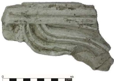
Fig. 35 Fragment of niche arches