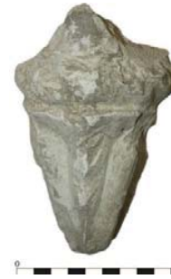
Fig. 48 Column headings (2011)