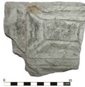
Fig. 31 Fragment with rectangle shape