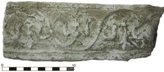
Fig. 27 Formed by inverted use of a bough-extended Lily motif