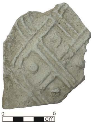
Fig. 29 Fragment with a geometric ornament