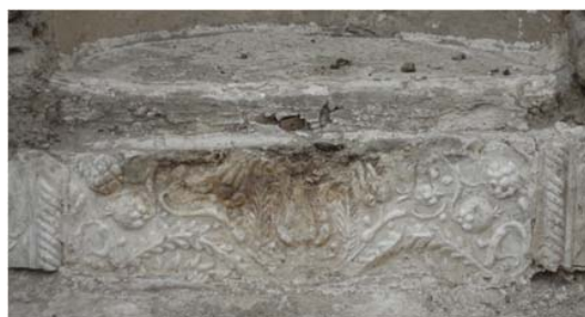
Fig. 15 Plaster plate that has been left in situ, under the oven niche. in northwest room of harem (excavation archive)