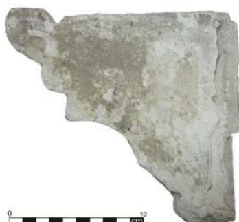
Fig. 37 Fragment of niche edges 2010