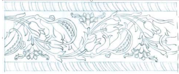
Fig. 4 Drawing of the full composition consists of tulips, carnations and leaves (S. Taş)