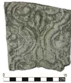
Fig. 22 Quadrivial leaf arrangement placing at the core of an oval layout