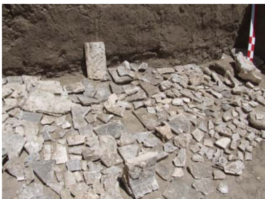
Fig. 13 Plaster fragments in 2009 (excavation archive)