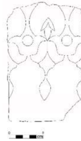
Fig. 6 Palmet series with a semisphere in their mid. (B. Koç)