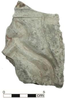
Fig. 45 Palmette-like broken fragments (31-AL 2015)