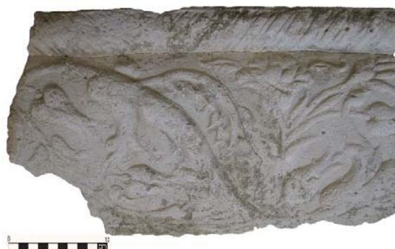
Fig. 16 Fragment has composition consists of tulips, carnations and leaves