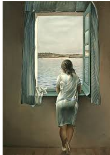
Fig. 3 Figure at the Window

In this painting, Dali's sister poses in the room where Dali spent his childhood. This room was on the first floor of Dali's parents' home in Cadaques. Dali had already admired Cadaques and found it so marvelous that he compared it to a beautiful dream - particularly the awakenings with what one sees from the window [6]. This room represents a saddened incident in Dali's life which is the death of his father. Dali knew of his father's death while he was painting in that room. Dali saw his father for the last time in this studio standing in the same position as that of his sister [6].