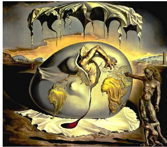
Fig. 1 Geopolitics Child Watching the Birth of the New Man