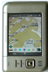
Fig. 2 Campus map