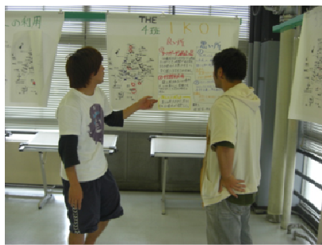
Fig. 5 The scene of their presentation