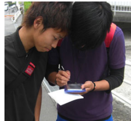
Fig. 3 Campus fieldwork Fig. 4 The scene of operating PDA