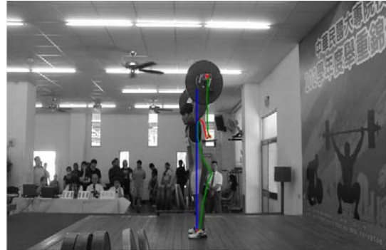
Fig. 1 Self-developed computer aided weightlifting training system with barbell trajectory

women's group 53-kilogramme class snatch action as an example. The competition was held in Gushan High School on 24th to 25th of May, 2014 in Kaohsiung, Taiwan, R.O.C. It was an open and public competition, and could be recording. We utilize a general consumer digital camera with a tripod to record videos. The camera position was set on the broadside of the lifters. The height and the position of the camera and tripod are fixed during the process. The focal length of camera is also fixed to record all of the trunk and side action of the lifters. We utilized a self-developed computer aided weightlifting training system to gather the barbell trajectory automatically and evaluate the performance of the lifter.