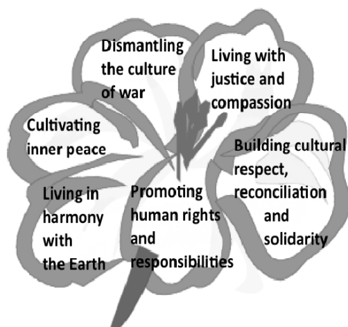
Fig. 1 The Flower Model

respect, reconciliation and solidarity; 5) living in harmony with the earth, and 6) cultivating inner peace [12].