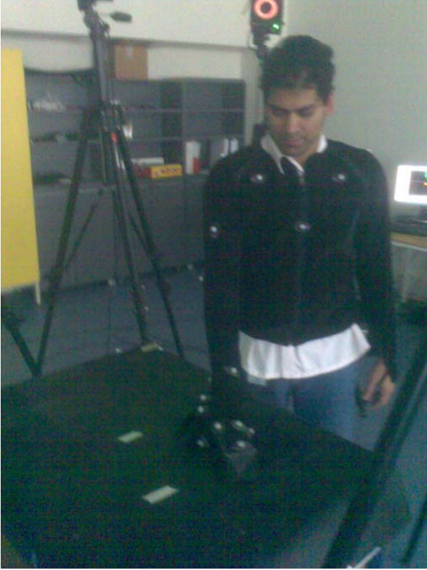
Fig. 1: The experimental setup showing the marker positions.

Therefore we look at the spatial variation to determine the placement of the Gaussians. We look at the arc length of the trajectory to determine if we have enough spacial variation to form a Gaussian. This way we avoid building a Gaussian that is too small. Our approach is outlined in Algorithm 1.