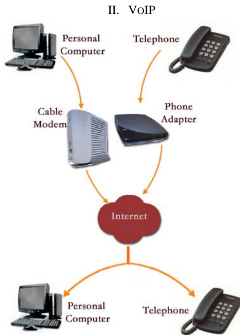
Fig. 2 VoIP Diagram

Using this technology, the instructor acts as both a discussion moderator and a live lecturer. It is at the discretion of the Instructor as to which method they use.