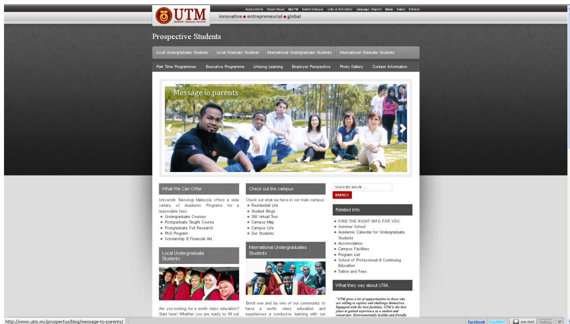
Fig. 5 Cultural Integration