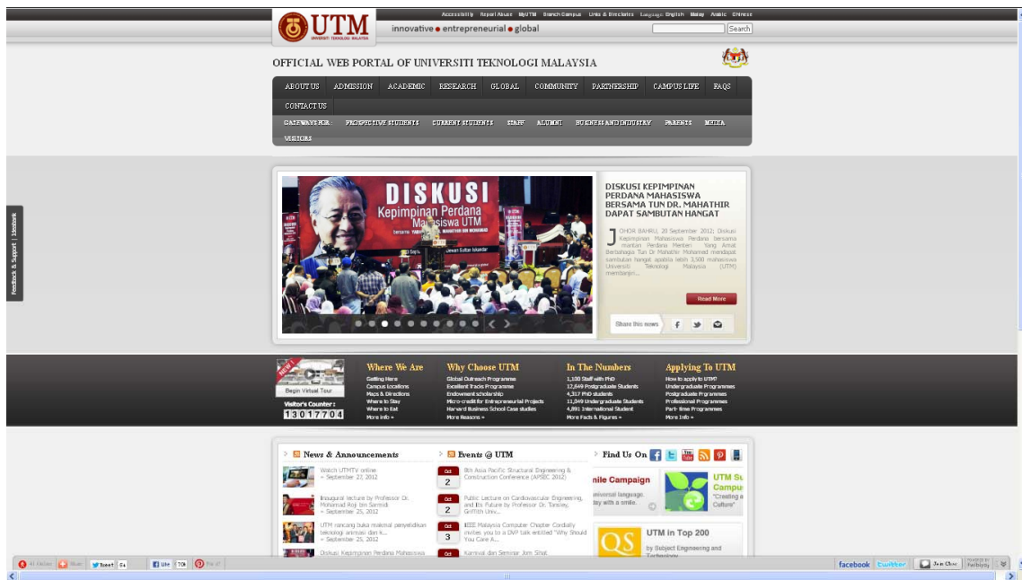
Fig. 4 The First Frame of Universiti Teknologi Malaysia's Website