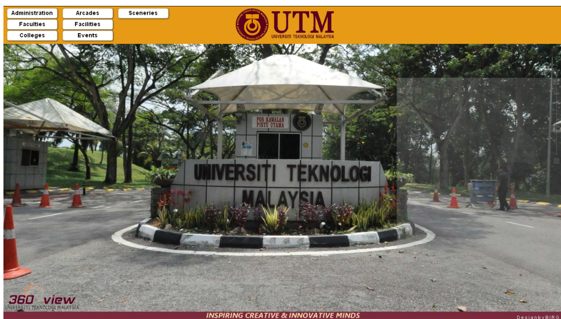
Fig. 6 Virtual Tour