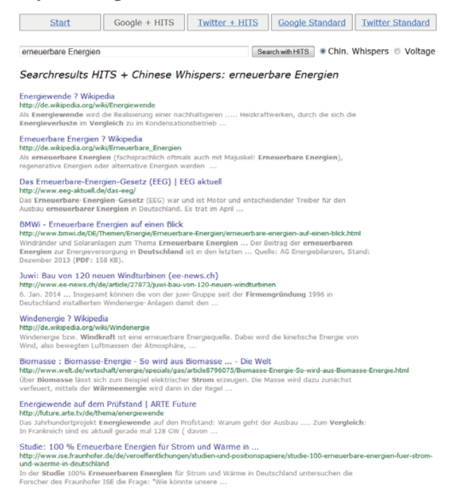
Fig. 4 Tracking the Topic: "Renewable Energies" (German: erneuerbare Energien)

The idea behind this approach is that especially the determined source topics can lead users to documents that cover important aspects of their analysed and presented search results. A first realisation of this idea in combination with the clustering approach outlined in the previous subsection has been presented and evaluated in [18]. In Fig. 4, a screenshot of the graphical user interface of this implementation along with an example result list for the query "renewable energies" (German: erneuerbare Energien) is given. The result page shows more topically specific entries (covering biomass and wind power) than Google's initial result list for this query. Further conducted experiments also confirm the validity of this new approach for topic tracking.